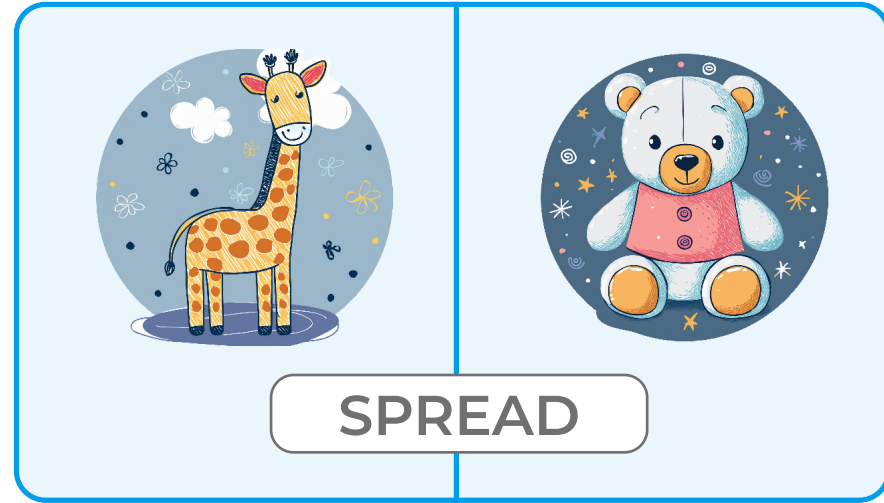
A SPREAD consists of two pages viewed together.