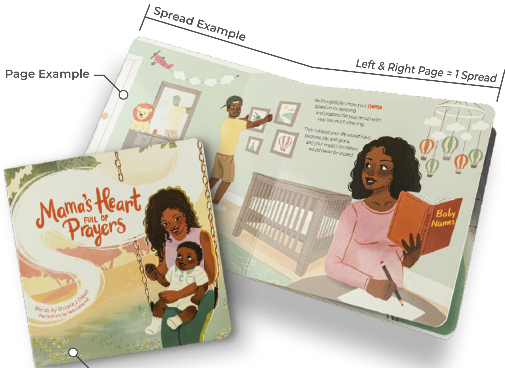
Front and Back Cover

The front and back cover are considered 1 spread